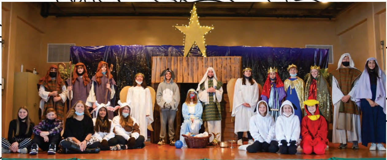
CHRISTMAS TRADITION — The eighth-grade class of Ss. Peter and Paul School in Collinsville carries on the school tradition of performing the play On Our Way to Bethlehem .