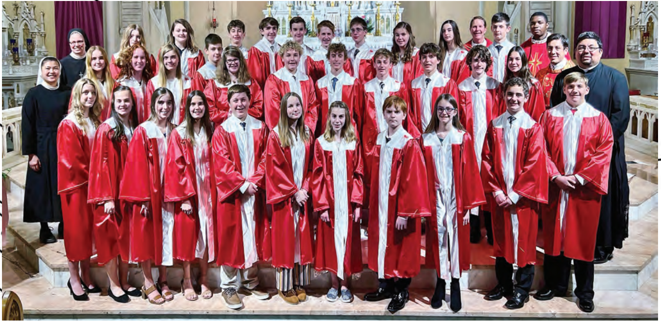
CELEBRATING CONFIRMATION — During the month of December, St. Mary School confirmed the sixth-, seventh-, and eighth-grade classes on three separate nights. Shown here is the eighth-grade class.