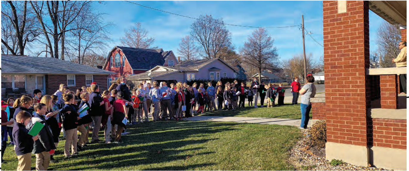
CAROLING — The students of St. John the Evangelist School enjoyed an unusually warm day in December by spending part of their afternoon Christmas caroling in the neighborhood surrounding the school. They spread the love and joy of Christmas to many shut-ins, family members, parishioners, and businesses throughout the community.