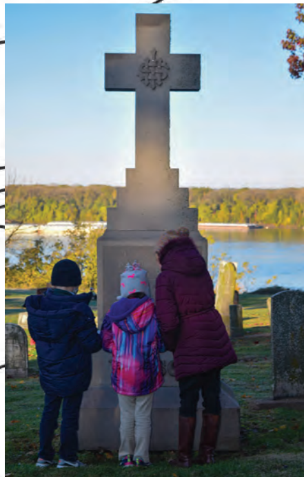
REMEMBERING FAITHFUL DEPARTED — Blessed Sacrament students in grades K-8 walked to Woodland Cemetery on All Souls Day to say prayers of remembrance for the faithful departed.