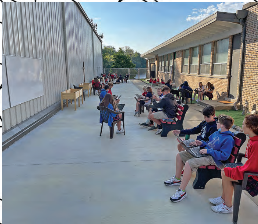
OUTDOOR CLASSROOM — Toward the end of the 2020-2021 school year, current St. Ambrose fourth-grade students asked if they could help pull weeds and clean up an eye sore area between our buildings. This inspiration led to the development of a project to enhance the space and create an outdoor classroom. Over $20,000 was donated to cover costs and to improve the space. To complete the project approximately 40 volunteers (including staff, students, parents, grandparents, and parishioners) attended a workday this past summer. With their efforts an amazing space was created for our students. Recently St. Ambrose applied for grants to add more features to the outdoor classroom. Here the seventh-grade St. Ambrose students enjoy using the newly developed area.