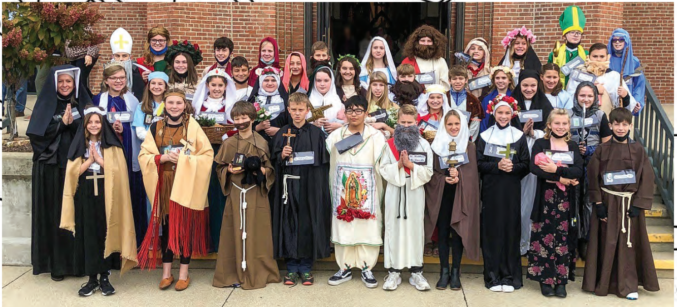
YOUNG SAINTS — St. Anthony Grade School celebrated All Saint's Day with their traditional All Saint's Day Mass. That day each sixth-grader dressed up as his or her confirmation saint, and then the "saints came marching in" at Mass.