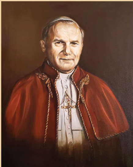
St. Pope John Paul II