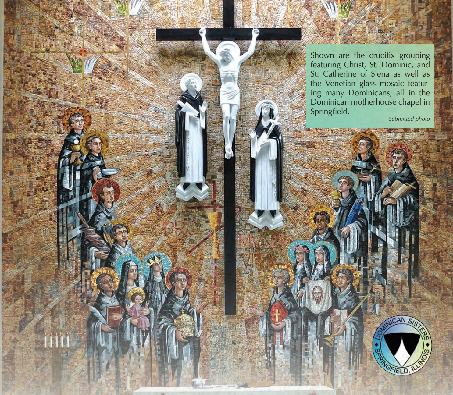
Shown are the crucifix grouping featuring Christ, St. Dominic, and St. Catherine of Siena as well as the Venetian glass mosaic featuring many Dominicans, all in the Dominican motherhouse chapel in Springfield.